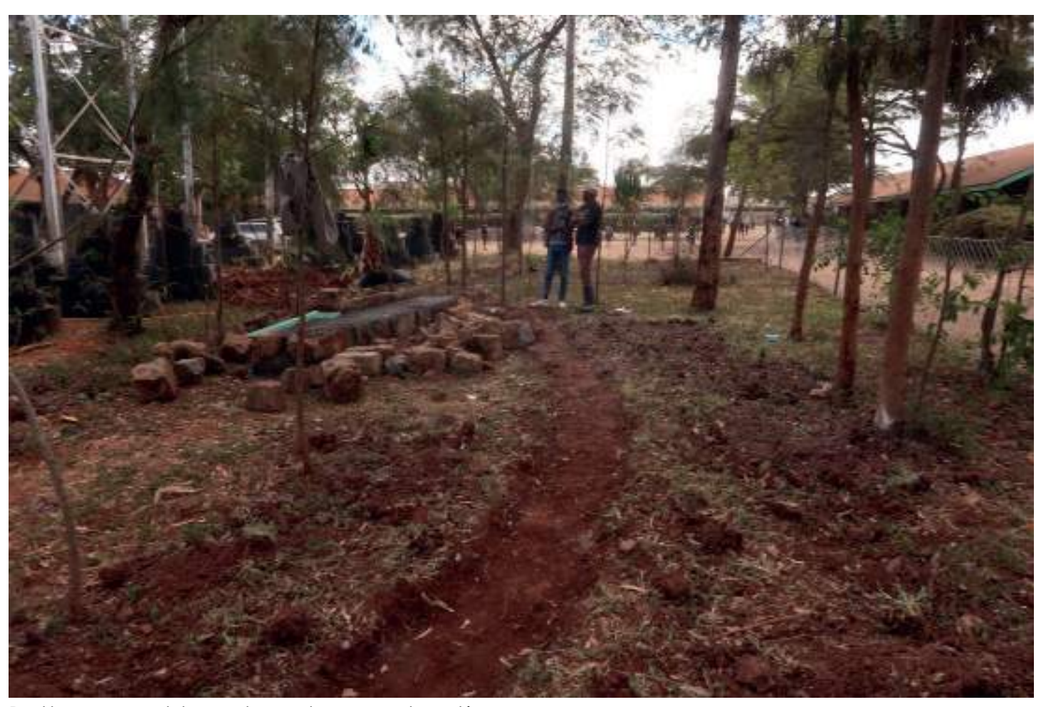
Pathway and bench under construction