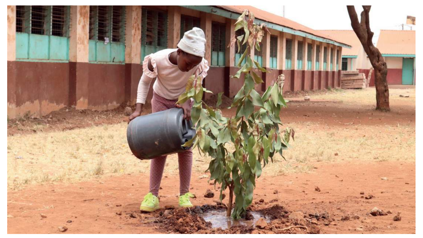
Trees planted together with the environmental club, to enable maintanance and long term establishment as well as teachning the knowledge of carbon sinks.