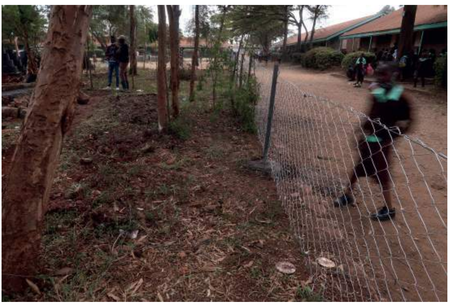
A transparent fence demarkate the border while enabling an overview for the students