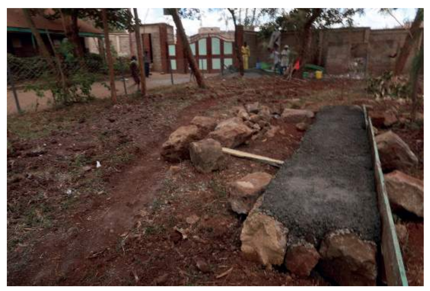
A bench creates a space for recreation and care for the park