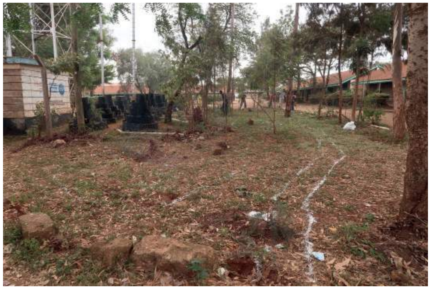
Preparation of Carbon Slnk Pocket Park